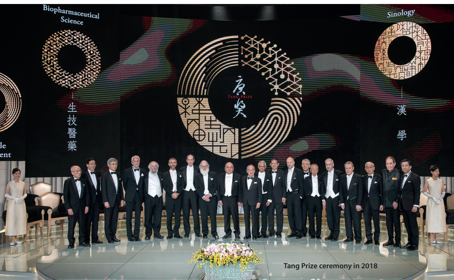
Tang Prize ceremony in 2018