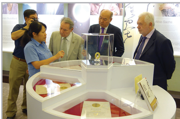
In the museum of the Tang Prize