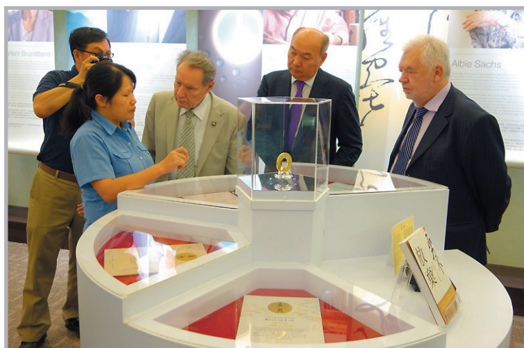
In the museum of the Tan Prize