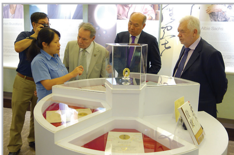
In the museum of the Tang Prize